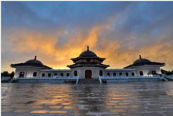
Mausoleum of Genghis Khan