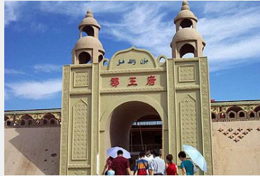
Mansion of Duke Ulan