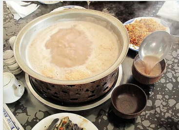
Mongolian Milky Tea