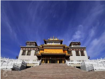
Living Buddha Palace