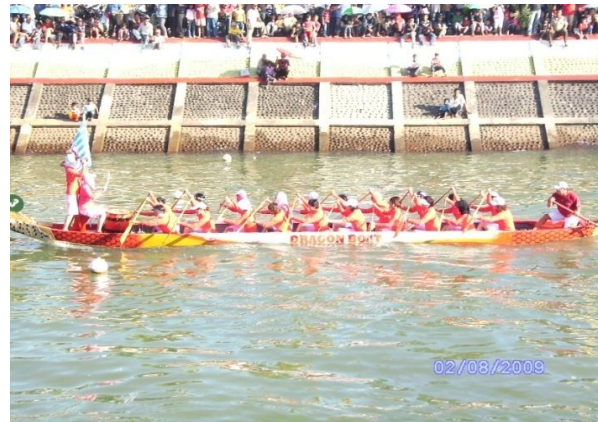
Padang Int Dragon Boat festival (The Icon of Tourism Event in Padang, West Sumatra-Indonesia (be held Every July)