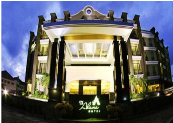
The Alana Hotel in Padang