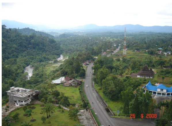
Malibou Anai Golf and Resort , 60 KM near Padang