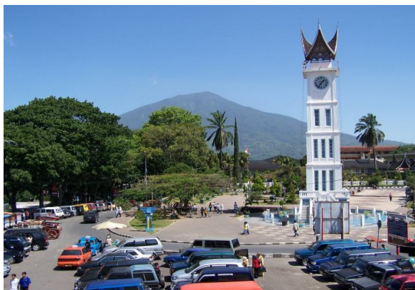
The Biggest Clock tower in Bukittinggi, & Japanese Tunnel, Japan colonial period, 1942 years in Padang, Indonesia (right)