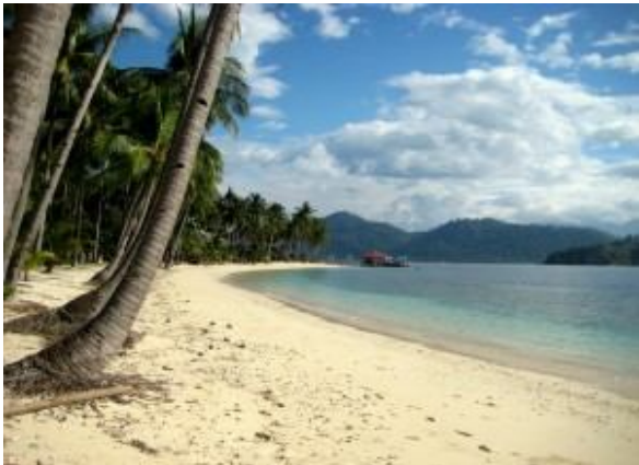
Sikuai Islands in Padang