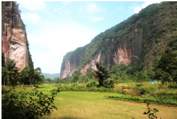
Harau Valley in Payakumbuh Town, 130 KM near Padang