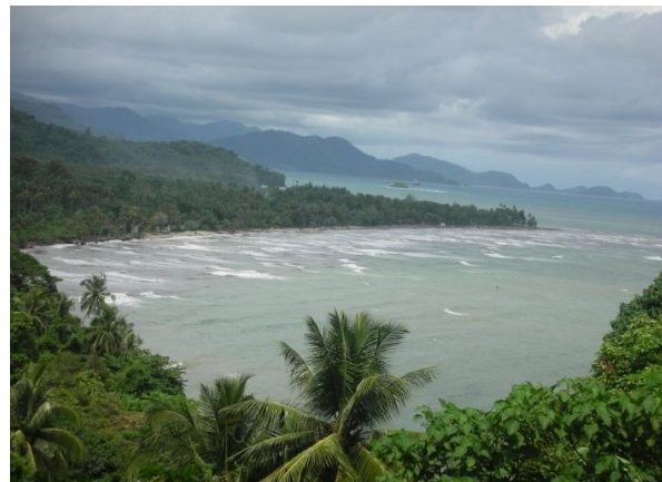
Views of Air Manis Beach in Padang