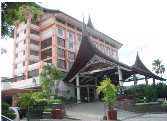
Bumi Minang Hotel in Padang