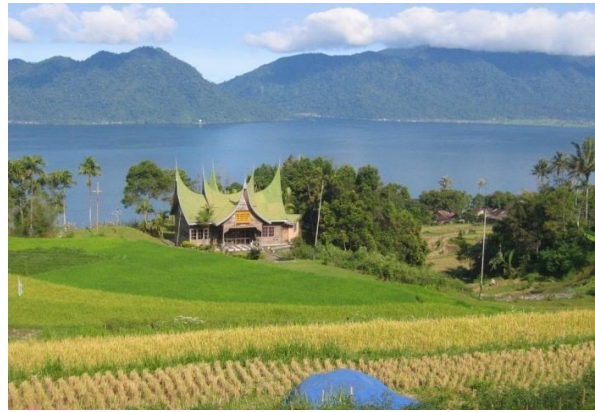
Traditional House Residents of Padang (Background Maninjau Lake)