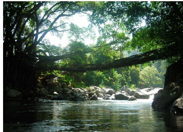
Langkaisu Mount ain The Root of Bridge in Painan Town, 70 KM southern Padang, West Sumatra-Indonesia