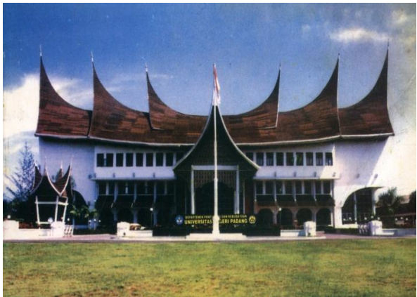
The Rectorat Building University of Padang