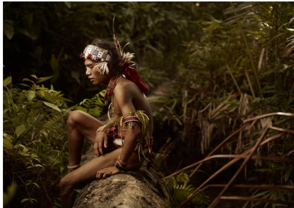
Mentawai Tribe and Traditional Clothing in Mentawai Islands 150 Miles western Padang, West Sumatra Indonesia