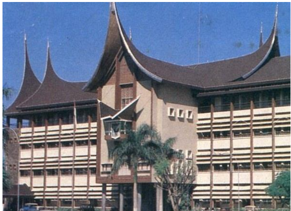
Governor Office West Sumatra in Padang