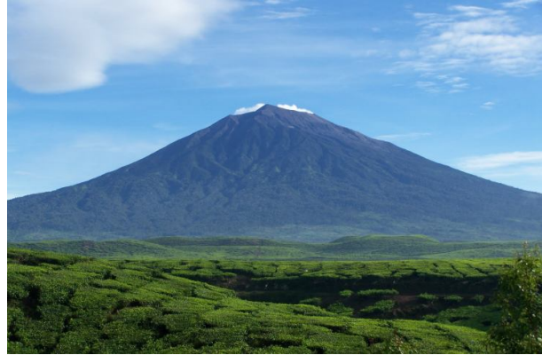
Marapi Volcano 2891 m Sea Above Level in Bukittinggi and Tea Garden in South of Solok, 200 KM southern Padang with background The Volcano Mount of Kerinci. The Highest Mountain of Sumatra Islands. 3805 M Sea Above Level