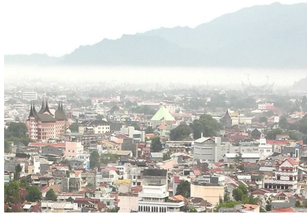
A point View of city in Padang