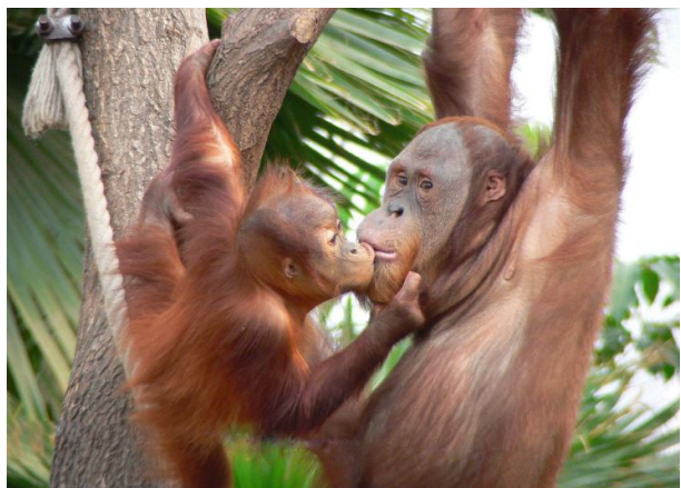
Panthera Tigris Sumatraen and Sumatran Orang Utan in Kerinci Seblat National Park, 200 KM near Padang West Sumatra