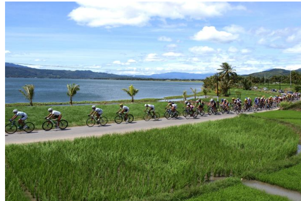
Tour de Singkarak, The Icon of Tourism Event in Padang, West Sumatra Indonesia (left and right) be held every June