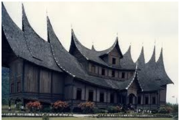
Pagaruyung Palace, 90 KM near Padang