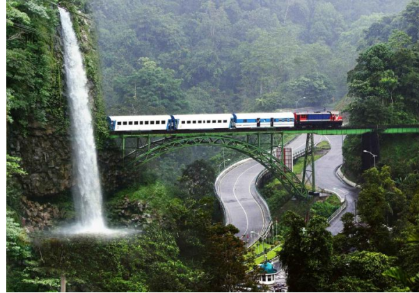
Anai Valley, 70 KM near Padang