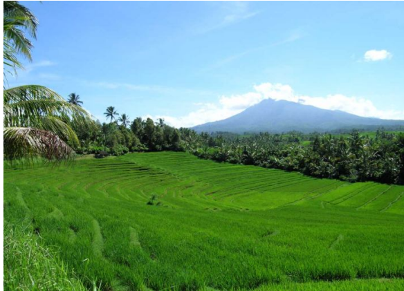
Plants of Rice, 30 KM near Padang