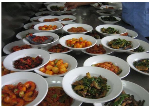
Cuisine of Padang and Culinary