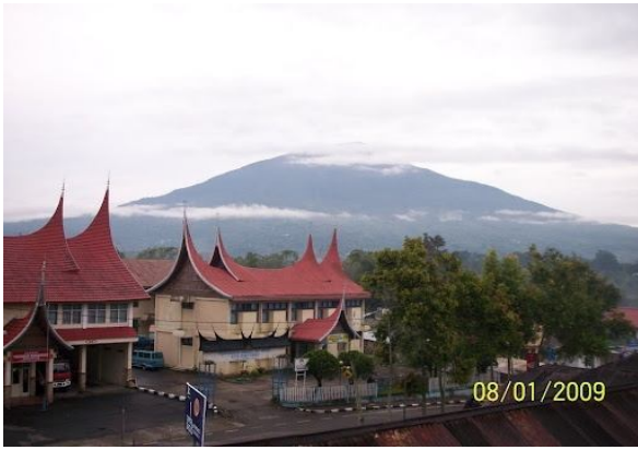
Singgalang's Mount View, 70 KM near Padang