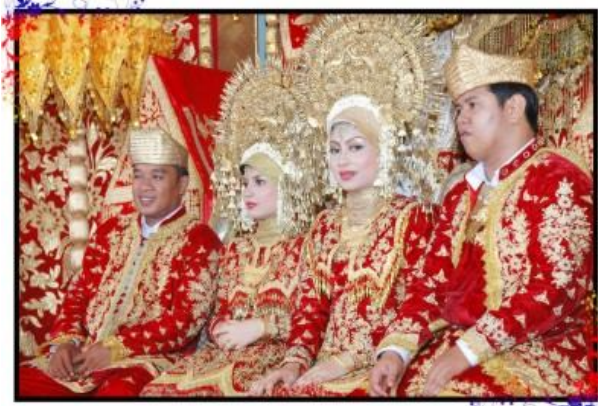
Minangkabau Traditional Clothing and Plate Dance (Uniquely Minangkabau, West Sumatra-Indonesia)