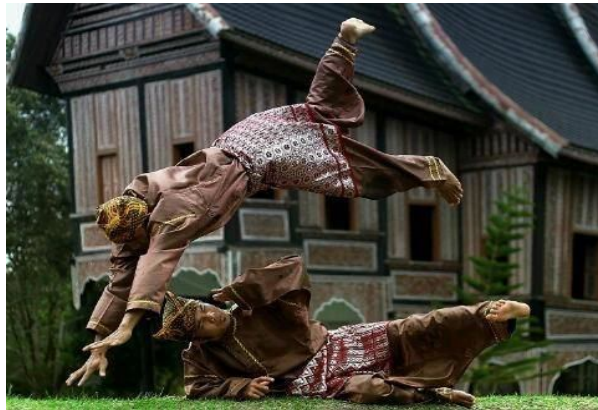
Minangkabau Traditional "Silek"