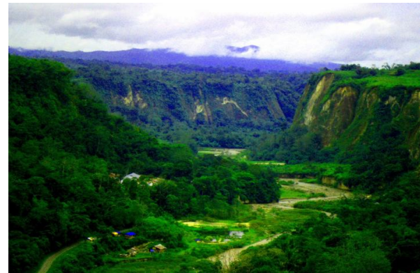
Sianok Canyon in Bukittinggi Town, 90 KM near Padang