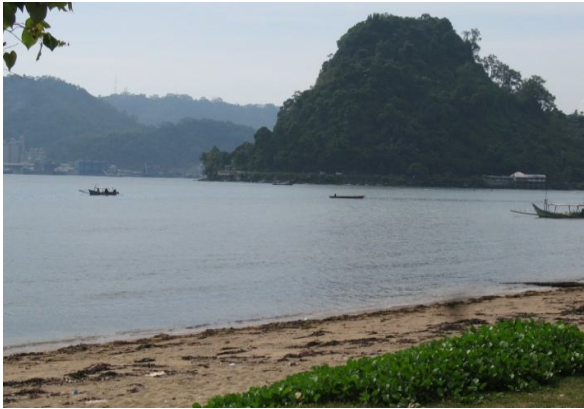
Nirwana Beach in Padang,