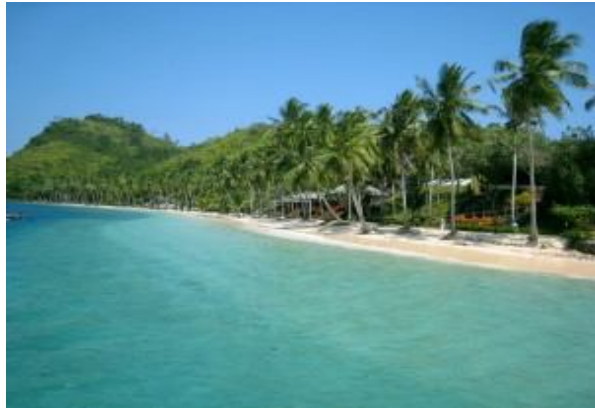
Beaches in Sikuai Island in Padang