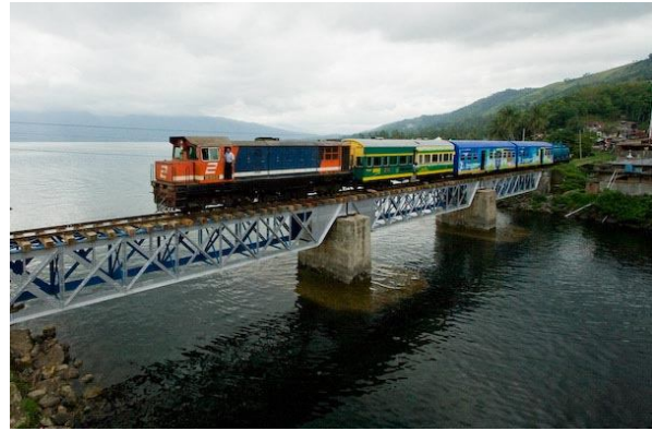
Singkarak Lake in Solok Regions, about 100 KM near Padang with The Ombilin Rivers (right)