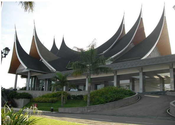
Bank of Indonesia Building in Padang