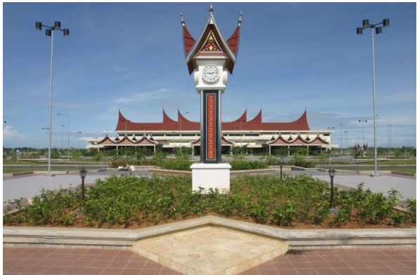
Minangkabau Int'l Airport (Uniquely Minangkabau Architecture)