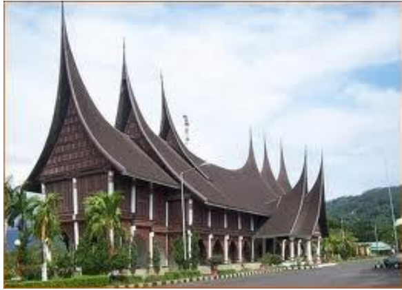
Recreational Public Park of Padang