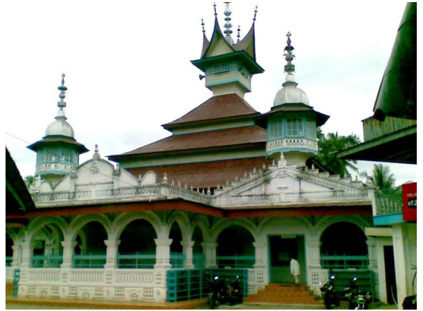
Winding Nines, 150 KM northern Padang and Koto Baru Mosque 70 KM Eastern Padang, West Sumatra Indonesia