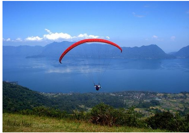
Twin Lake Regions in Solok 90 KM Eastern Padang, and Maninjau Lake, seen from the height of "Puncak Lawang"