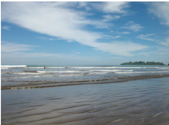
Air Manis Beach in Padang