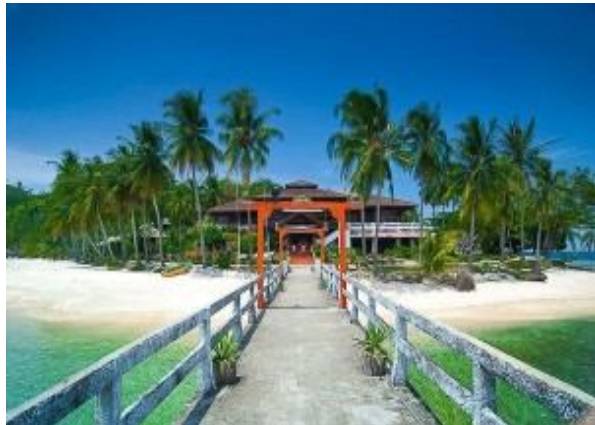
Cubadak Resort near Padang