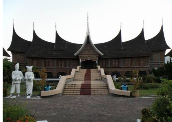
Adityawarman Muzeum of Padang