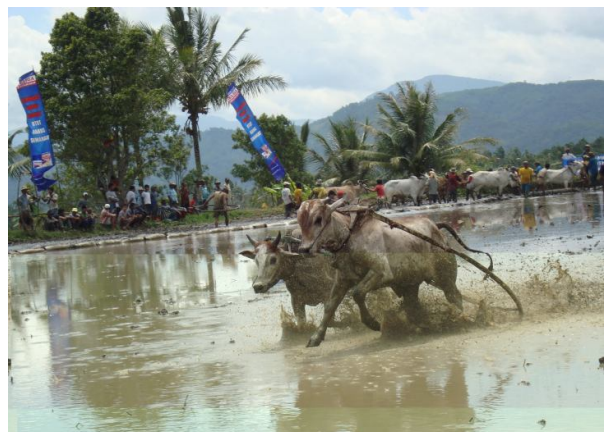
People's Party of "Tabuik" in Pariaman 60 KM near Padang & Local Traditional games PACU JAWI 100 KM near Padang