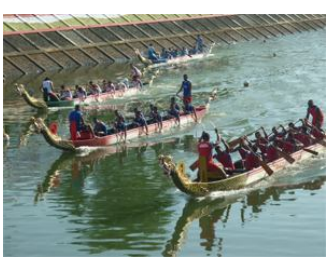
Pictures of Padang Dragon Boat Int'l Festival 2011 on Banjir Kanal or Banda Bakali's River Water Park Complex

Padang is the capital and largest city of West Sumatra, Indonesia. It is located on the western coast of Sumatra an area of 694.96 square kilometres (268.33 sq mi) and a population of up to 1,000,000 people at the 2011 years. And Banda Bakali Rivers water park, is located right in the City Centre of Padang, The Land Of Minangkabau West Sumatra Indonesia, covering an area of 200 hectares. Being an original river it focuses on the concept of a recreational park bringing an image for its uniqueness.