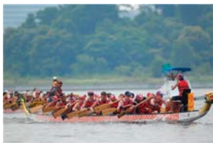
British Dragon Boat Team Leading

The 2nd Putrajaya International Dragon Boat Festival will be held at the same venue in the middle of June 2010.