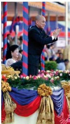
(Left) Cambodia's King Sihamoni claps as the participants in traditional dragon boats pass by during the first day of the 3 day annual Water Festival boat race on the Tonle Sap river in Phnom Penh, 1st November 2009.