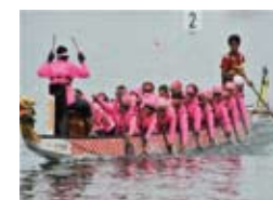
Pink Spartans Singapore

There were both International and Malaysian races over 500m and 2000m, with the most popular competitions were the Putrajaya International Challenge and the International and Malaysian Open Races. The races ran smoothly and to time throughout the festival and all in all, a great weekend was enjoyed by all the participants.