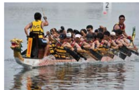
National University Of Singapore