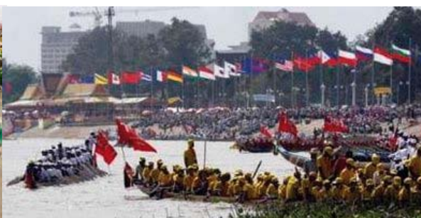
Hundreds of traditional wooden dragon boats gather and paddlers participants stand by during the first day of the Water Festival Boat Races on the Tonle Sap river in Phnom Penh.