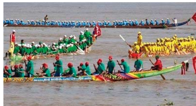
A crew heads to the start line where other crews are already waiting before a race in the water festival in Phnom Penh, Cambodia