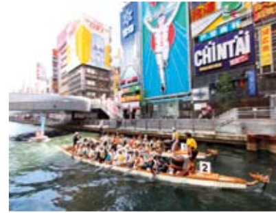
(Photo: The boats paddle their way by the famous billboard on Dotonbori Canal)

The organizing committee invited ideas and plans on how citizens could appreciate and enjoy rivers and waterfronts in our city known for rivers, canals and 808 bridges. The ODBA responded by proposing a Dragon Boating tour around this water-friendly City of Osaka. The proposal was awarded the official status of a participatory event.