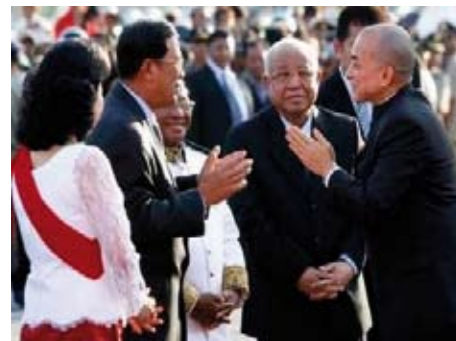
(Right) Cambodia's King Sihamoni greets Prime Minister Hun Sen (2nd L) as President of Senate Chea Sim (2nd R) looks on while they attend the first day of the annual Water Festival boat races in front of the palace in Phnom Penh.