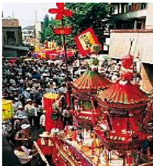
Dancing in sacrificing rites n Confucius Temple

The United Nations Educational, Scientific and Cultural Organization (UNESCO) seeks to encourage the identification, protection and preservation of cultural and natural heritage around the world considered to be of outstanding value to humanity. This is embodied in an international treaty called the Convention concerning the Protection of the World Cultural and Natural Heritage , adopted by UNESCO in 1972.