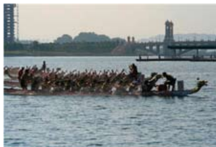
Racing To The Finish Line