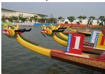
The Dragons at Rest