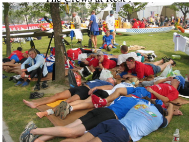
The Crews at Rest !