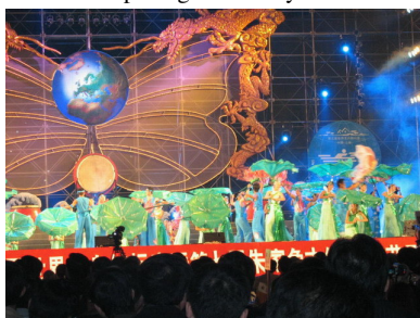
The Opening Ceremony