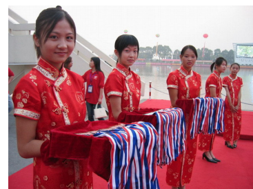
The Medals and Les Femmes